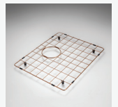
ACBPCU-1 Bowl Protector