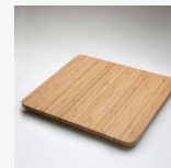
ACP104F Bamboo Board