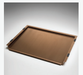
ACP109CU Bench Top Drainer Tray